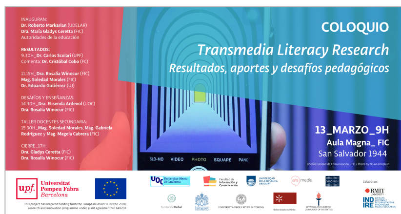
Figure 2. Poster of the colloquium program

Evaluation: the secondary teachers had a high evaluation of the learning materials and made important suggestions to adapt the cards to the local contexts of their specific subjects.